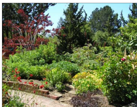
Gardens seen from Great Room