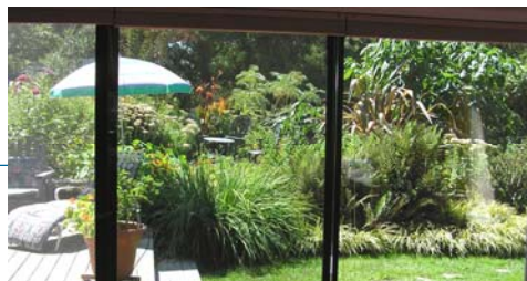
View from Great Room