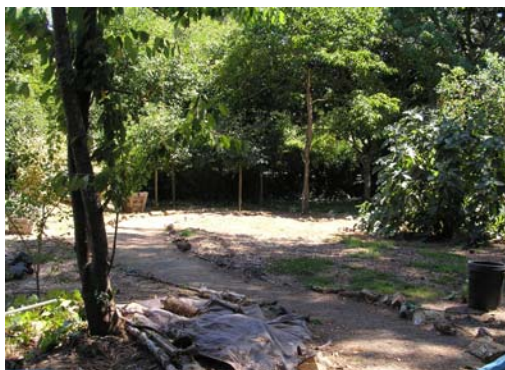
Orchard Path surrounds future meditation garden