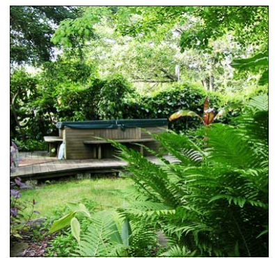
Hot tub set in ivy-bordered privacy